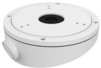
DS-1281ZJ-S Inclined Ceiling Mount