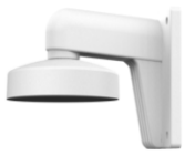
DS-1272ZJ-110-TRS Wall Mounting Bracket