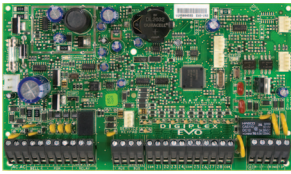
EVO192: 8 to 192-Zone Control Panel